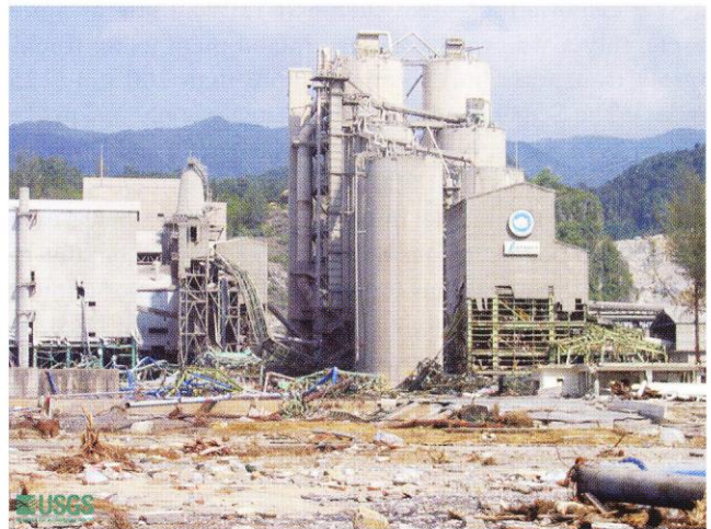
Figure 6 Damaged cement plant.

The raw meal is pre-heated using coal and placed in a kiln. Temperatures reaching 2000°C (3632°F) heat the raw meal to 1500°C (2732°F), and then the material is drastically cooled by air blasting. This heating and cooling process creates cement clinkers, the basic element in the production