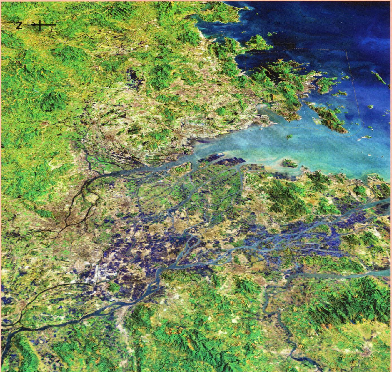
3D Landsat-7 Satellite Image of the Pearl River Delta, China

A Multi-disciplinary Journal of Remote Sensing & GIS