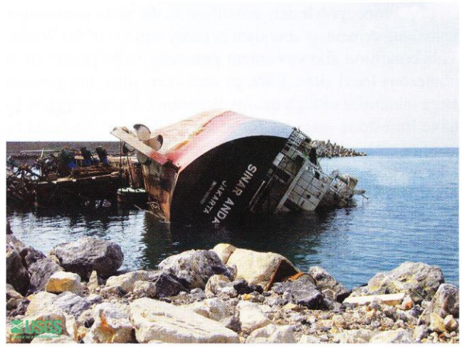
Figure 5 Capsized ship at the Semen Andalas cement plant's dock.

used to transport cement to Belawan, Lhokseumawe and Batam Island for packing. The cement plant also encountered significant damage (Figure 6). Of the 625 people working at the plant, 262 are still missing. Initial estimates indicate that it will take nearly 100 million US dollars to put the plant and dock back into operation (Risk Management Solutions). A comparison of Figures 1 and 2 shows how the coastline has been eroded back to the perimeter of the plant.