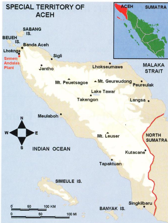
Map Special Territory of Aceh, Indonesia