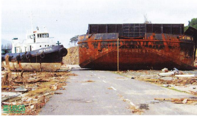
Figure 4 Tugboat and barge washed ashore by the tsunami.