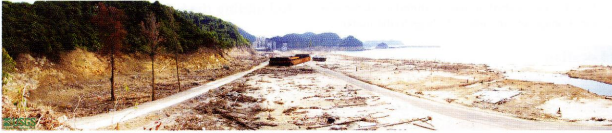
Figure 3 View from Lhoknga, Aceh, looking down the devastated beach toward the Semen Andalas cement plant.